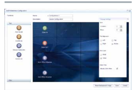
Time and attendance web terminal

The report generator can be used to generate special analyses on bookings, persons or alarm messages of the system. Users are thus provided with precisely the information that they need for their work.